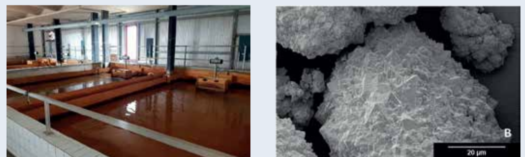
Fig 1. Left; a drinking water production plant, right; SEM picture of bioscorodite [3].

Finally, the recovered iron needs to be obtained in a quality/purity suitable for other applications. Potential end-users could be WWTPs for phosphate removal or bio fermenters for sulfide elimination. If reuse in drinking production is possible, lower operational costs can be obtained, making safe drinking water more available.